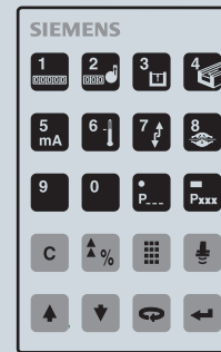
MultiRanger 100/200 HydroRanger 200 HydroRanger Plus SITRANS LUC500

*Note: To order the IS version of this hand programmer, order 7ML5830-2AH.