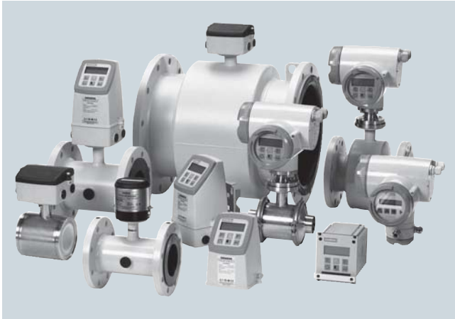
SITRANS F M family

SITRANS F M electromagnetic flowmeters are designed for measuring the flow of electrically conductive mediums.